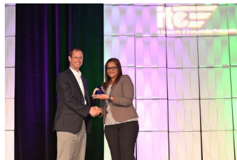
Student Chapter Award (see next page)