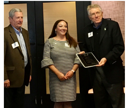
City of Columbus Receiving their Award