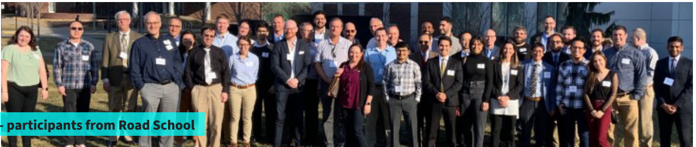
Group photo - participants from Road School